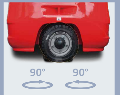
The small turning radius is suitable for narrow channel