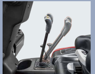
Cover can be easily opened by adjusting the levels forward