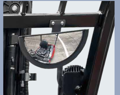
Panoramic rearview mirror