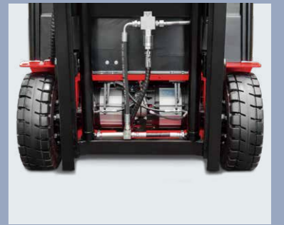
Front dual separated motors